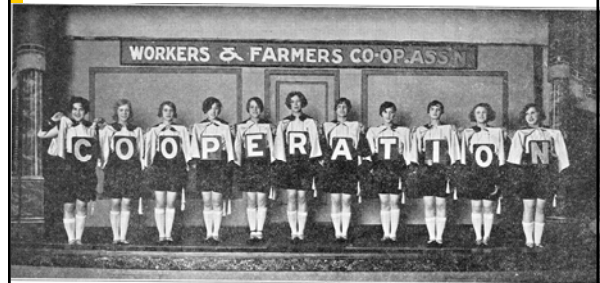
Entertainment at the annual meeting